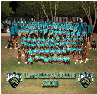
JAGUARS LIVE OAK JAGUARS JAGUARS 2009

Visit our website for additional onsite registration locations